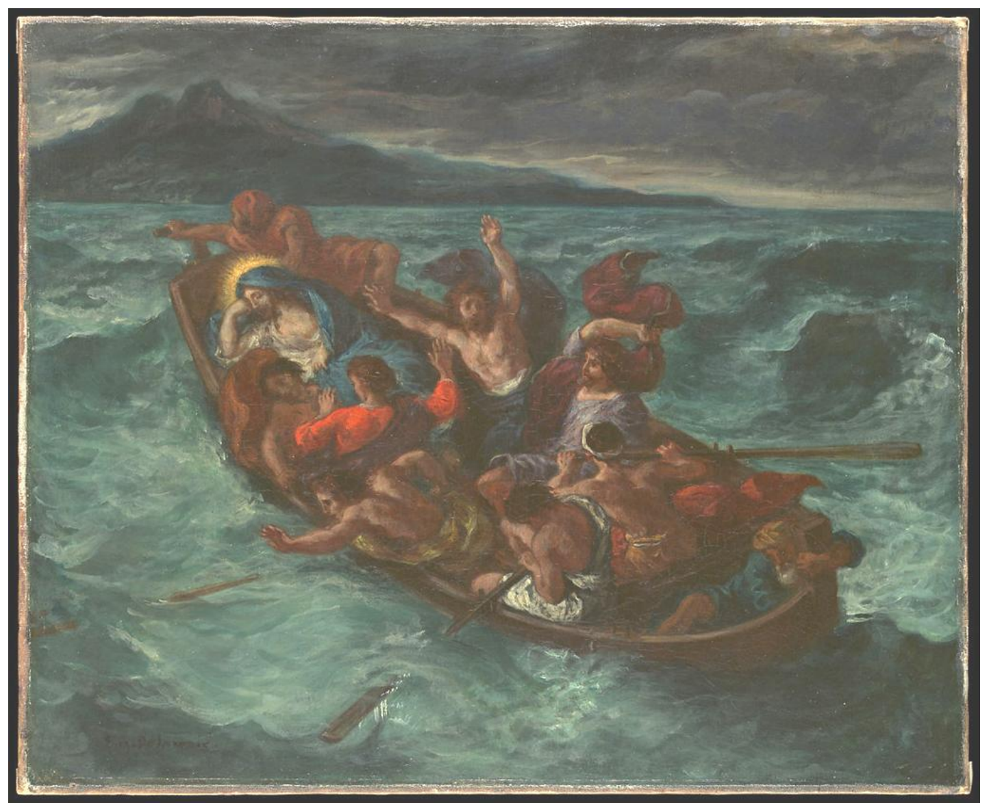
Eugène Delacroix, Christ Asleep during the Tempest, ca. 1853

THE EPISCOPAL CHURCH IN FINDLAY, OHIO WELCOMES YOU