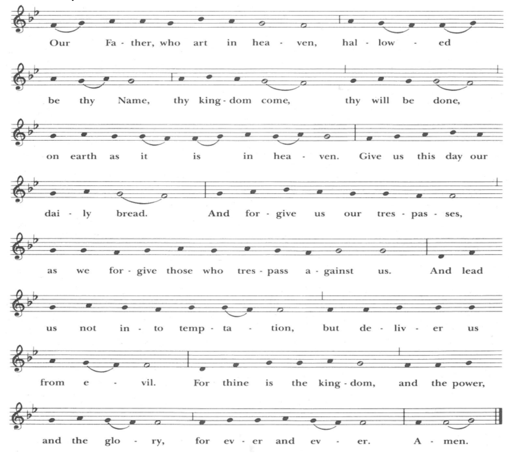
The Bread is broken and silence is kept, after which is sung