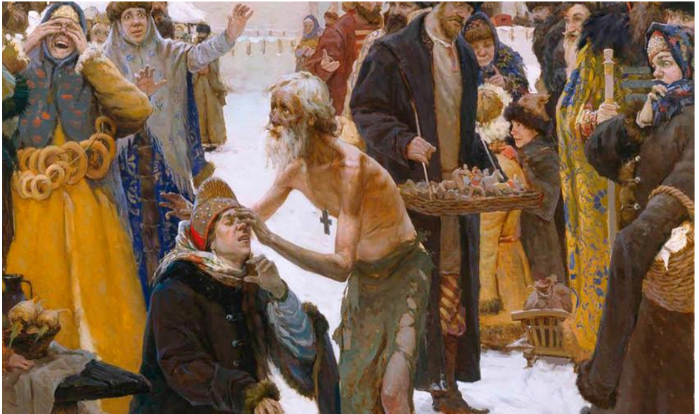
Vitaliy Grafov, Saint Basil the Blessed , 2006

THE EPISCOPAL CHURCH IN FINDLAY, OHIO WELCOMES YOU