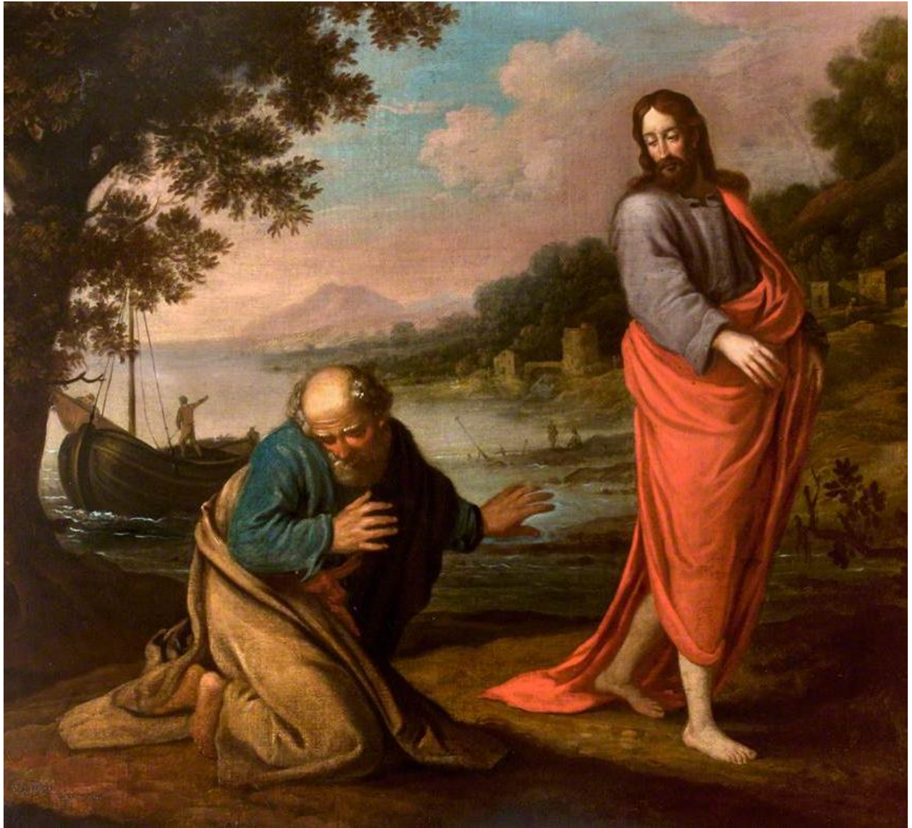
Christ Rebuking Saint Peter, Flemish School, c. 1600

THE EPISCOPAL CHURCH IN FINDLAY, OHIO WELCOMES YOU