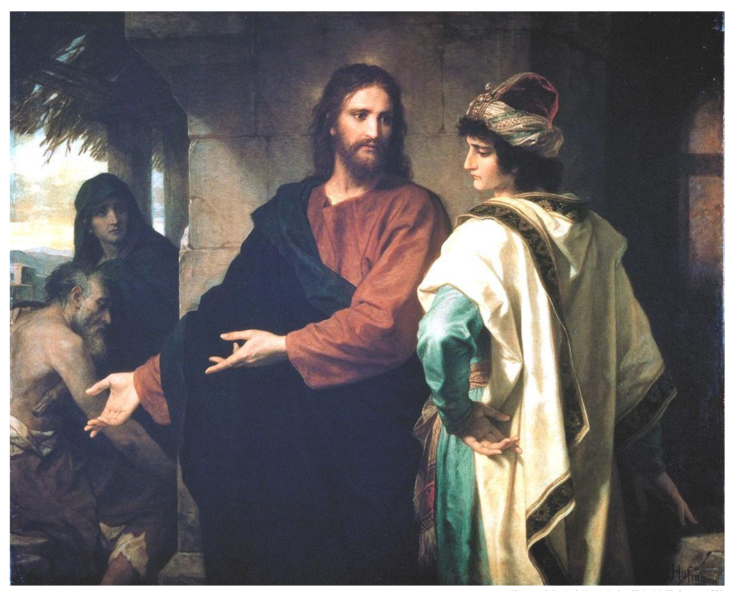
Christ and the Rich Young Ruler, Heinrich Hofmann, 1889

THE EPISCOPAL CHURCH IN FINDLAY, OHIO WELCOMES YOU