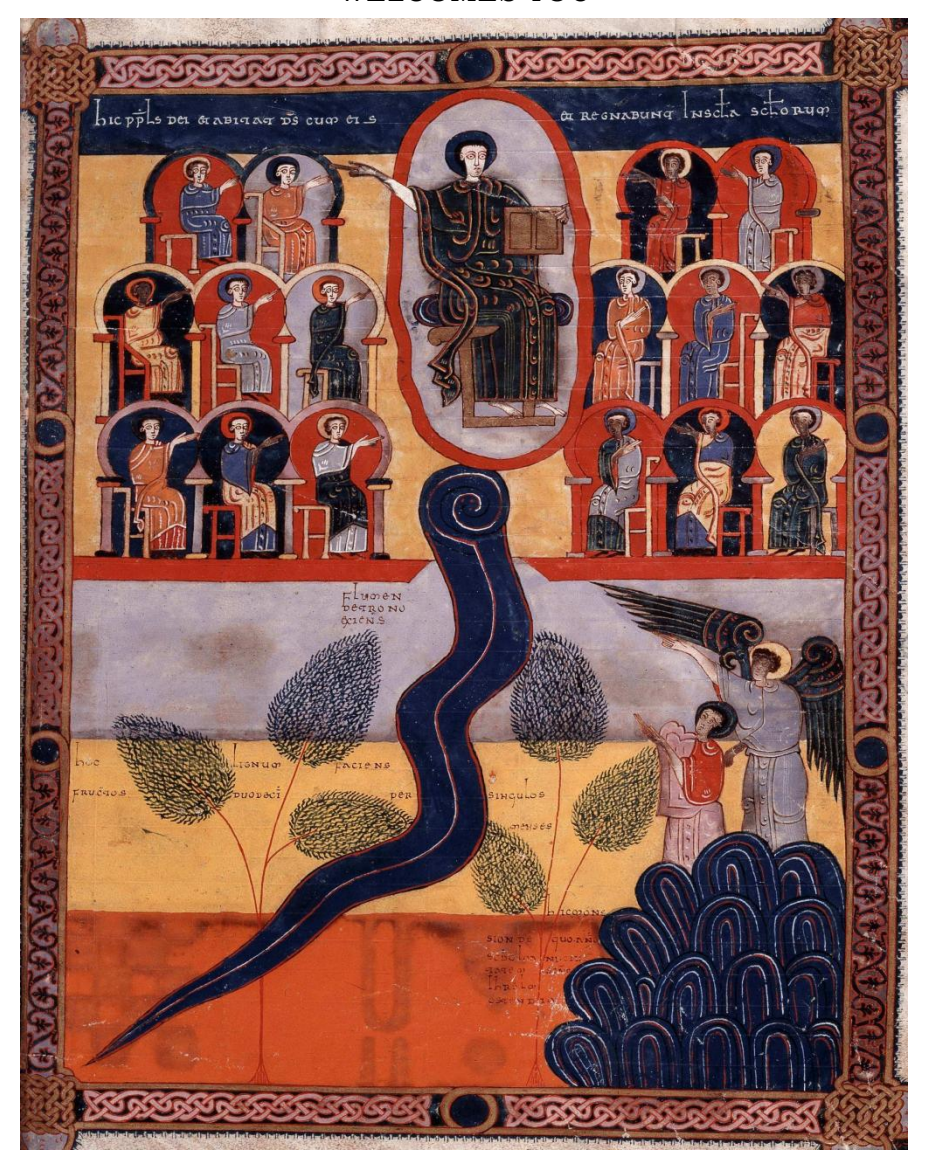
The New Jerusalem and the River of Life (Apocalypse XII), from Beatus de Facundus, 1047

THE EPISCOPAL CHURCH IN FINDLAY, OHIO WELCOMES YOU