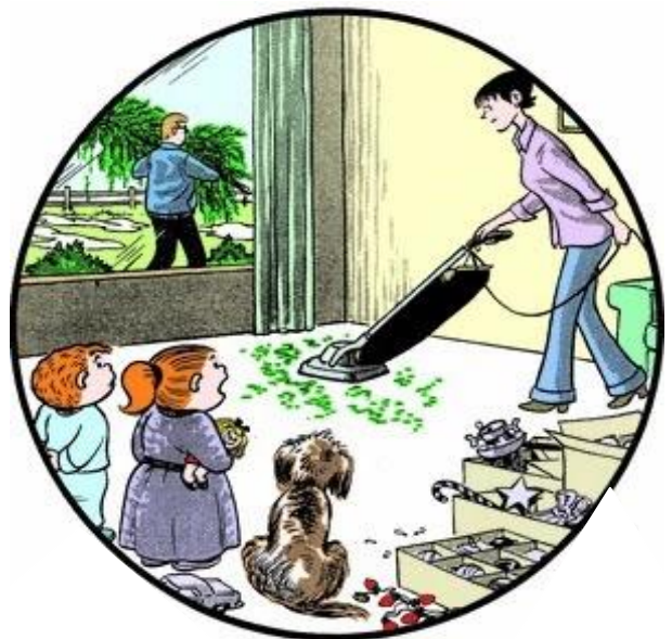
"Gosh – that corner looks really lonely now."

If ever there is a name omitted from one of these lists, or if an item is incorrect, please contact the church office with the info.