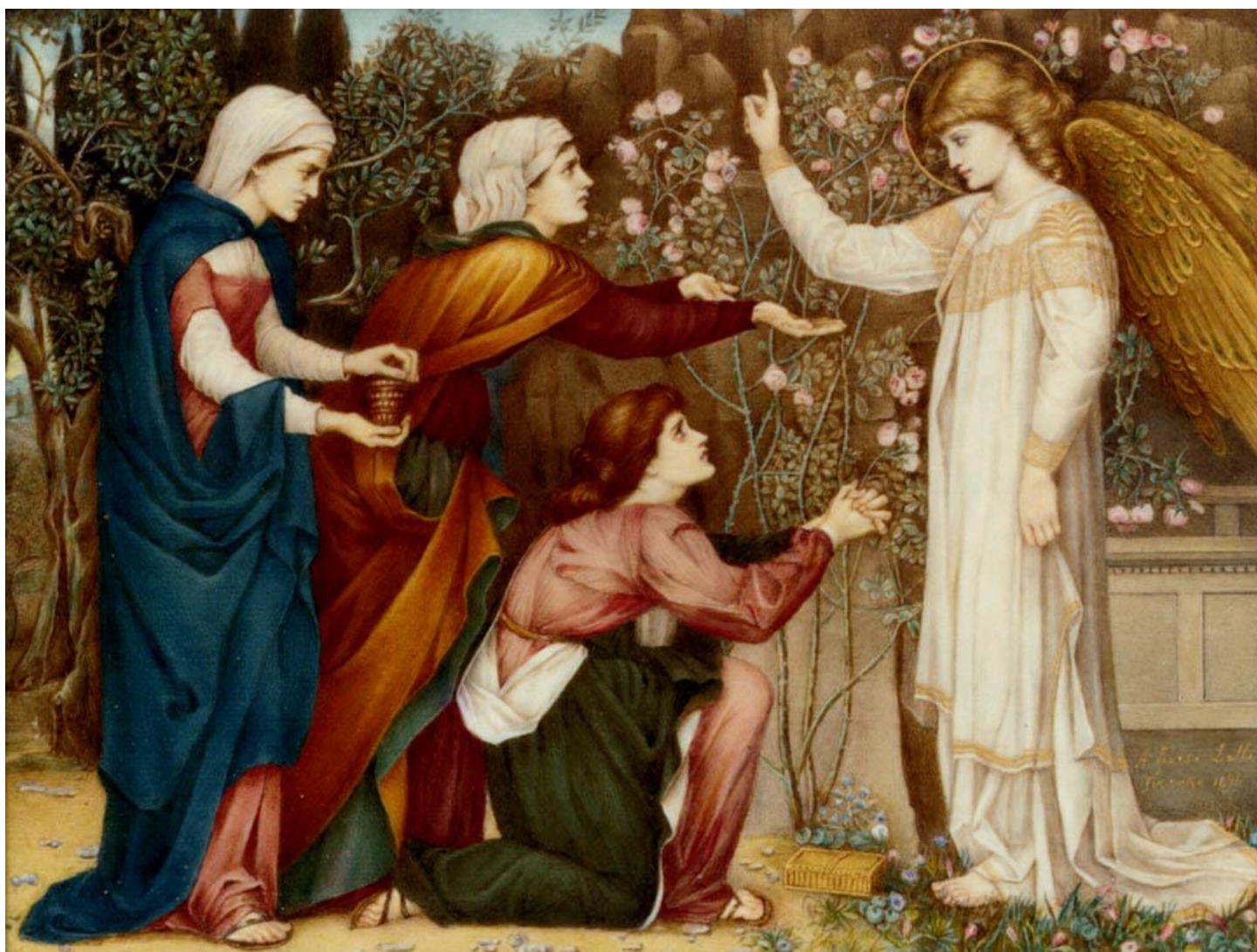
Why seek ye the living among the dead? , John Roddam Spencer Stanhope, 1890

THE EPISCOPAL CHURCH IN FINDLAY, OHIO WELCOMES YOU