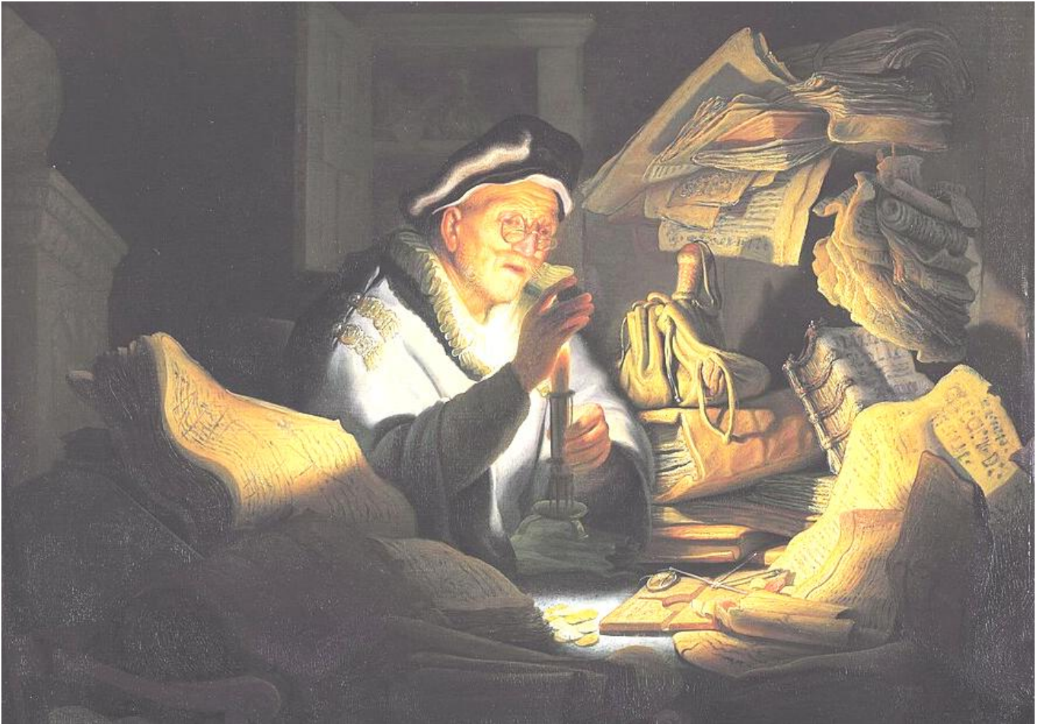
The Parable of the Rich Fool, Rembrandt, 1627

THE EPISCOPAL CHURCH IN FINDLAY, OHIO WELCOMES YOU