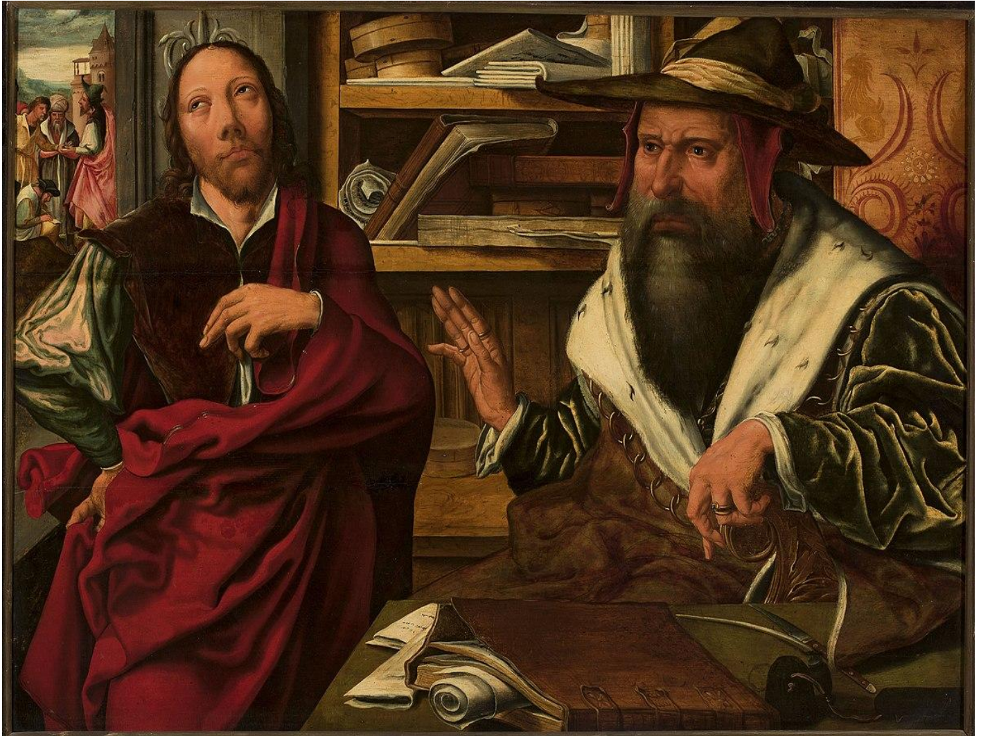
Parable of the Unjust Steward, Marinus van Reymerswaele, early 16th Century

THE EPISCOPAL CHURCH IN FINDLAY, OHIO WELCOMES YOU