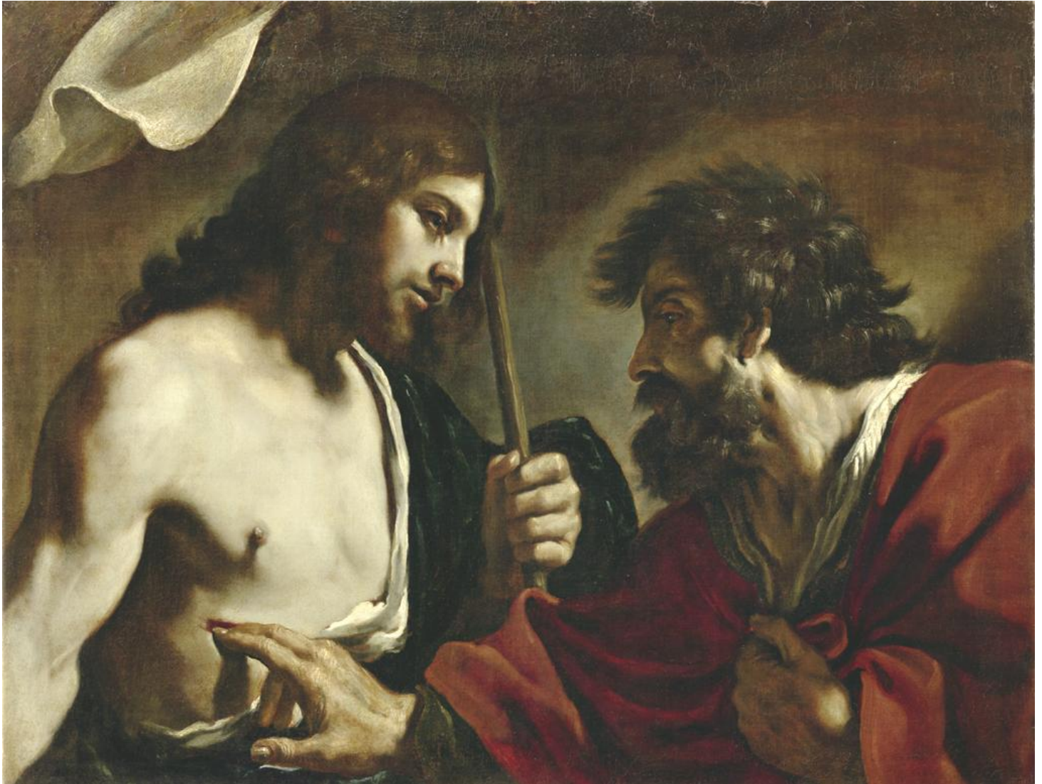
Giovanni Francesco Barbieri, The Incredulity of Saint Thomas , after 1621

THE EPISCOPAL CHURCH IN FINDLAY, OHIO WELCOMES YOU